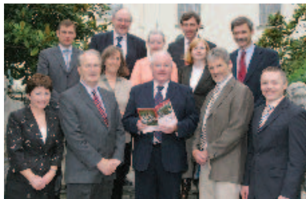
Minister Brendan Smith, TD at the launch of the Code of Practice for the welfare of Broiler Chickens.